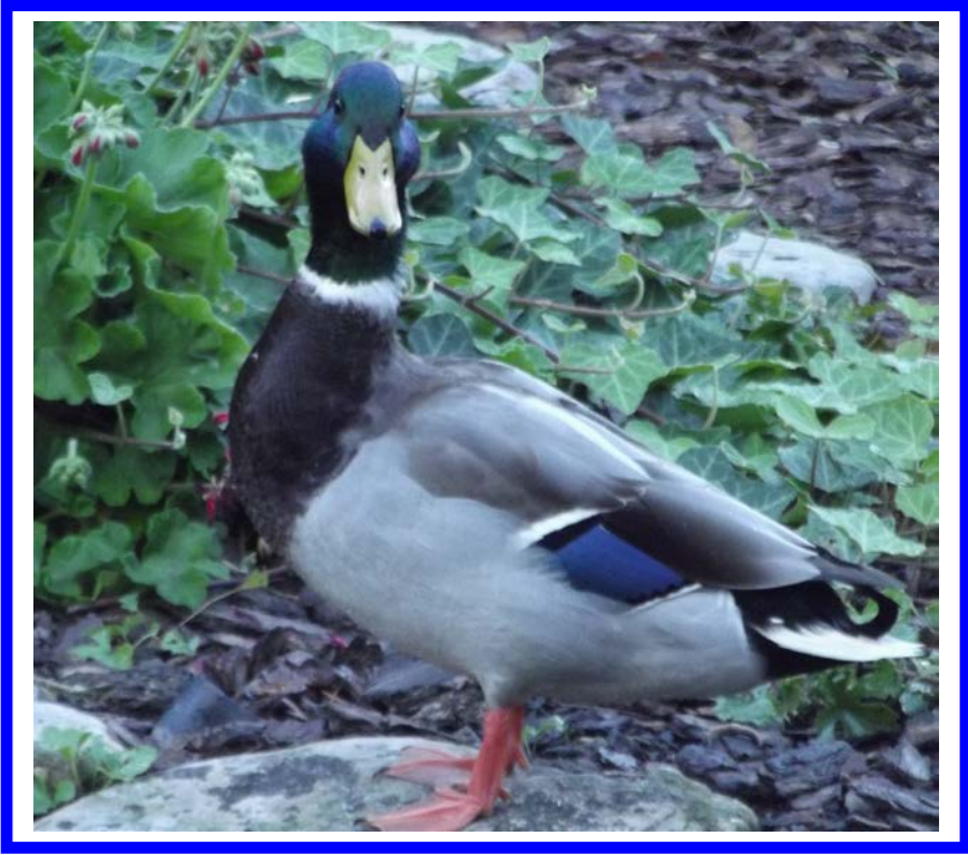
Our resident mallard, Mr. Duck..

He and his Mrs. have been coming into our backyard pond for some years now. Last summer she laid eggs, but the nest was raided, we think, by some possums that we later live-trapped and moved, and also waterlogged due to the extreme amount of rain. One day we watched, fascinated, as she flew off with her remaining 4 eggs, one by one, and dropped them into the field across the road.